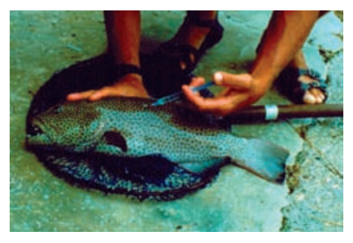
Fig. 18. Giving an intramuscular injection to a female squaretail coraltrout (Plectropomus areolatus) in Palau to induce ovulation.