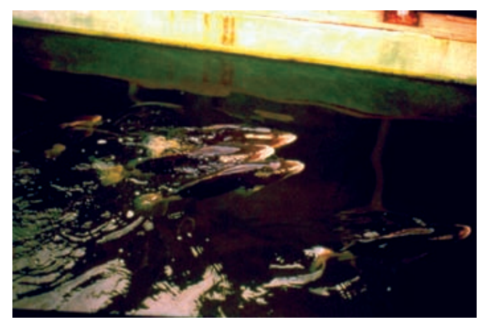
Fig. 17. Nassau groupers (Epinephelus striatus) spawning in a concrete raceway (3.0 \times 12.2 \times 1.0 \text{ m deep}) in Florida. In the center are a female flanked by two males; at the lower right are two females that have ovulated but are not yet spawning.