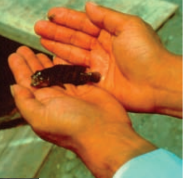
Fig. 22 (above). Stocking-sized Malabar grouper (3 g) in Taiwan.

In the Indo-Pacific and Middle Eastern regions, several species of grouper are farmed in cages, ponds and tanks, but mostly they are raised from wild juveniles and are fed trash fish. They