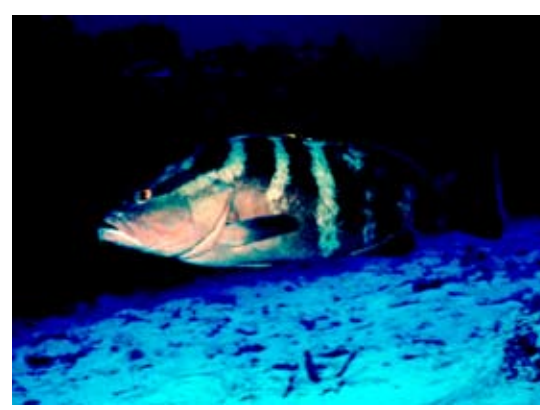
Fig. 5. Nassau grouper ( Epinephelus striatus ) at Grand Cayman.