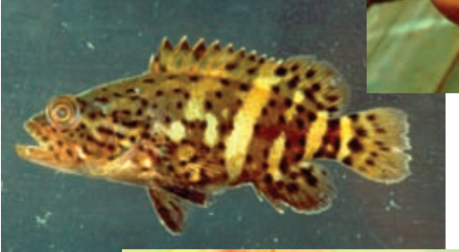
Fig. 21 (below). Minimum stockingsized Goliath grouper in Florida (55 mm, 2 g).

rent and/or not feed well. Early grouper larvae, especially when stressed, sometimes exude a large amount of mucus, which can cause them to stick to each other, to the surface film, or to solid objects.