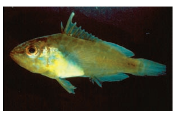
Fig. 24. Gag ( Mycteroperca microlepis ) in Florida (32 mm, 1 g).

In isolated locations where groupers have been severely depleted, it might be possible to replenish spawning stocks with reared fish. In an experimental study, 27 Nassau grouper raised in tanks in Florida (309-367 mm TL, 579-1,098 g, mean 909 g) were released and monitored by a diving team on an open ocean reef with depths of 1-15 m at St. Thomas, U.S. Virgin Islands (Roberts et al. 1995). For three months before release, live and frozen foods were added to their diet. Although they had been raised on pellets, the groupers ate live goldfish and crabs within seconds after they were placed on the bottom of their raceway. After release, they exhibited behavior until then expected only from wild groupers. Within 1 hour after release from a holding cage, all the groupers had gobies and shrimp remove ectoparasites obtained while they were in the cage. Within 2 days, some were seen hunting alongside a moray eel or octopus. It was surprising that these behaviors known for wild groupers were innate and did not have to be learned by the hatchery fish. Although their tags had been lost, two