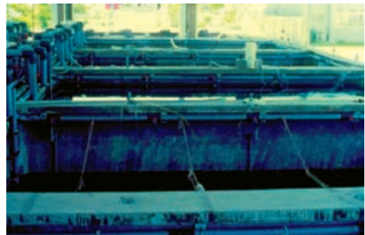
Fig. 12. Concrete larval rearing tanks, each 50 m<sup>2</sup>, in Japan.