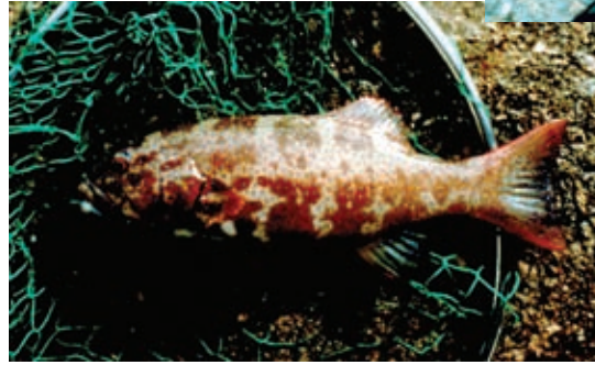
Fig. 4. Leopard coraltrout ( Plectropomus leopardus ) at Palau.