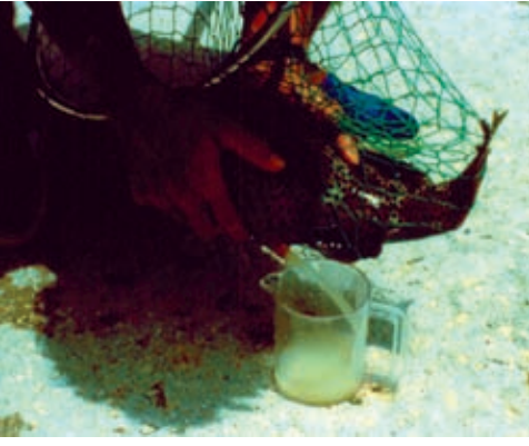
Fig. 19. Stripping eggs from a squaretail coraltrout (Plectropomus areolatus) in Palau. (Photo by John Tucker)

Fig. 18. Giving an intramuscular injection to a female squaretail coraltrout (Plectropomus areolatus) in Palau to induce ovulation. (Photo by John Tucker)