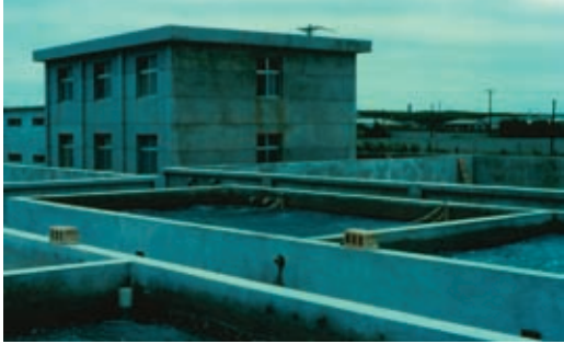
Fig. 14. Concrete larval rearing tanks in Taiwan, usually shaded when larvae are stocked.