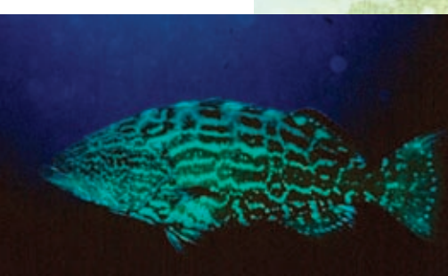
Fig. 7. Black grouper (Mycteroperca bonaci) at Grand Cayman.