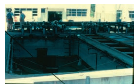
Fig. 13. A 50-m<sup>3</sup> concrete larval rearing tank in Japan (from the group in Fig. 12).