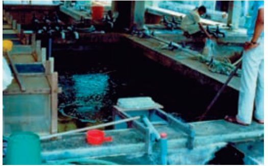
Fig. 11. A 26-m<sup>2</sup> concrete larval rearing tank at the National Institute of Coastal Aquaculture, Thailand.