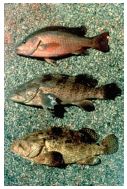
Fig. 1. Asian red snapper (Lutjanus argentimaculatus), orangespotted grouper (Epinephelus coioides) and brownmarbled grouper (Epinephelus fuscoguttatus) being grown out in Singapore.