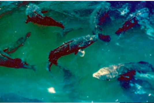
Fig. 2. Malabar grouper (Epinephelus malabat broodstock in Thailand.