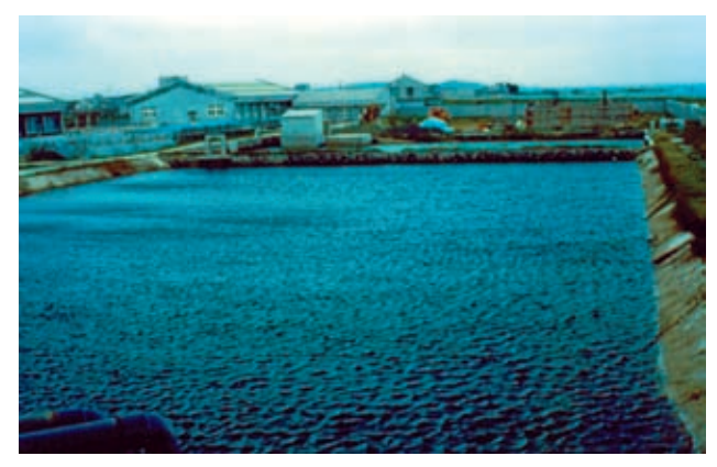
Fig. 16. A pond used for growing out groupers in Taiwan.

Most groupers that have been studied will mature within 2-6 yr (Tucker 1998). Many serranids are proto-gynous hermaphrodites (i.e. most individuals mature first as females and some of them become males later). Some of those species, as a